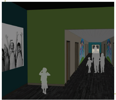
MLC Kids Preschool