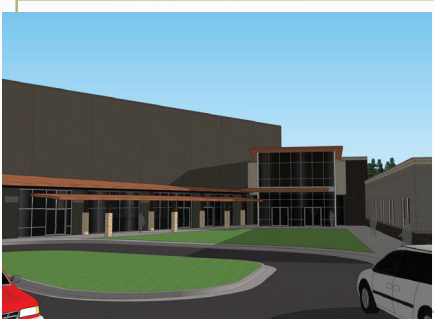
New Front Entrance

Over the next 20 years, Forsyth County is expected to grow more than any Atlanta-metro county, percentage-wise. God is bringing new families to our community and within our sphere of influence and He is calling us to our next phase of creating a church where life change stories are written. For many, the church building is the first place people feel a part of God's family. Thousands of people will find the peace of God here and our building should reflect that.