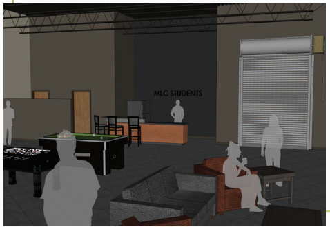
MLC Students Lobby