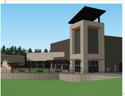
Courtyard with Entrance to Lobby and MLC Students