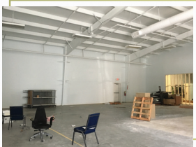
MLC Adult Worship