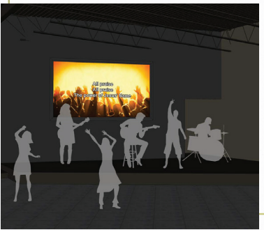
MLC Students Worship Space