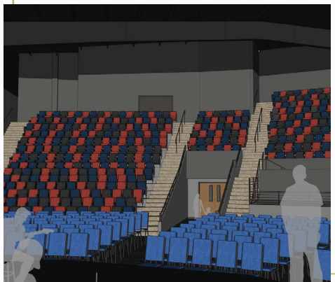
MLC Adult Worship