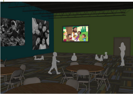
MLC Kids Elementary